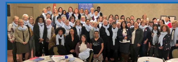
PHOTO | YWCA leaders from across Canada in Ottawa.

YWCA leaders from across Canada joined the Advocacy Day on Parliament Hill . In meetings with 68 Members of Parliament and Senators, we called for $75 million in core funding to scale up existing YWCA employment and training programs across Canada. These investments will support women to move out of poverty, build confidence in their skills and abilities, increase their financial independence and build strong economic futures. In the lead up to the 2019 federal budget and election, we will continue pressing for action. Advocacy works!